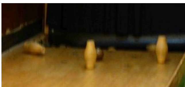
The results of all the fine bowling