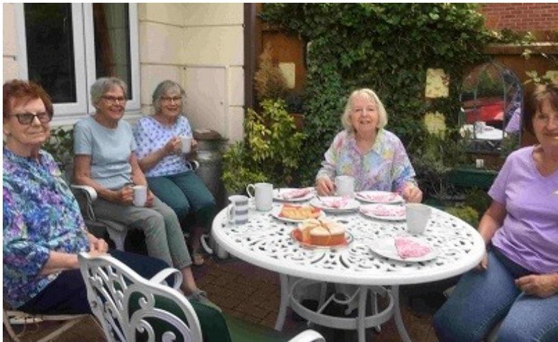
Monday Book Club meeting in June. Weather was suitable for an outdoor location.