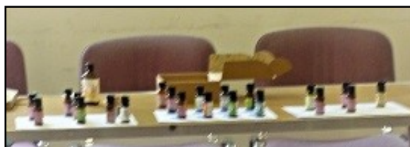
Above—3 sets of ingredients on table

The ingredients were displayed on a table:-