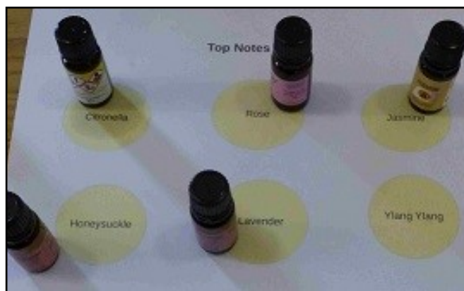
First set of ingredients—6 Base Notes