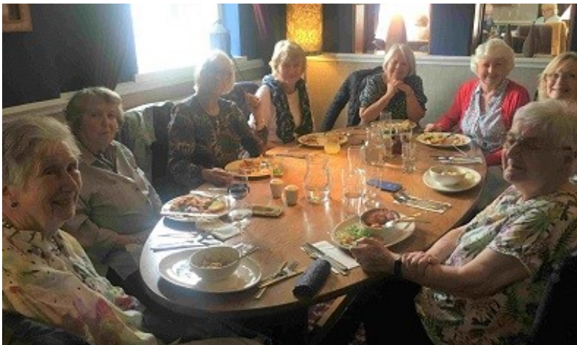
Dinahs Group met in June 2023.