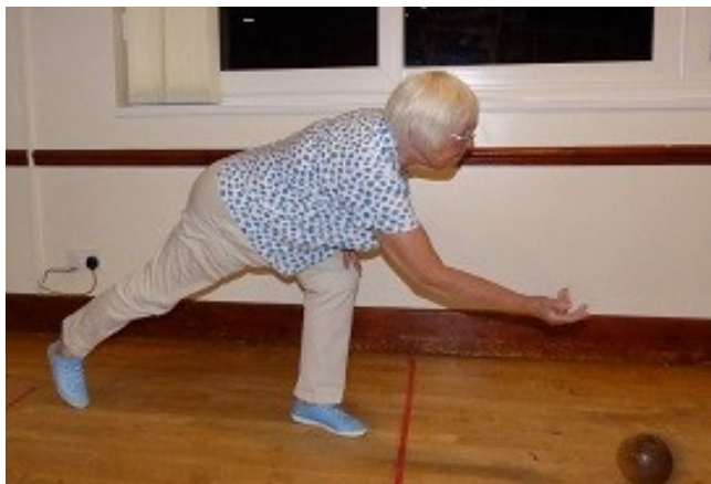
Another fine bowling action